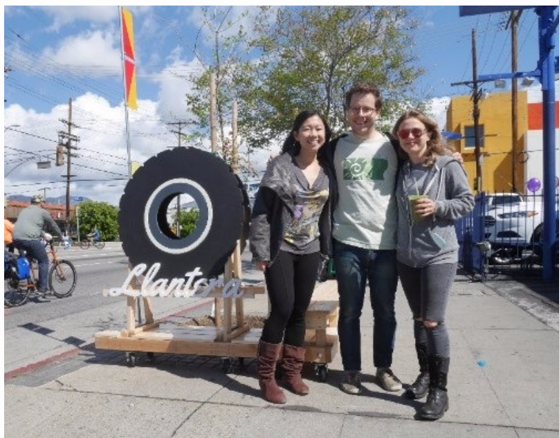
Throwback to one of our March Challenge Grant events, Pacoima Street Values.